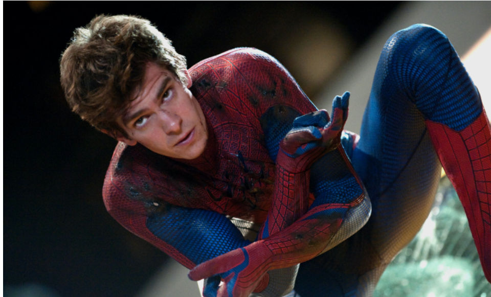
Andrew Garfield poses as Spider Man for The Amazing Spider-Man.

After his appearance in “Spider-Man: No Way Home,” fans rallied support for Andrew Garfield’s “The Amazing Spider-Man” franchise to finish his story with one more film.