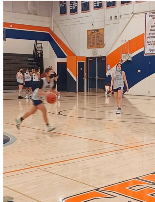
Girls Basketball practicing for a up coming game