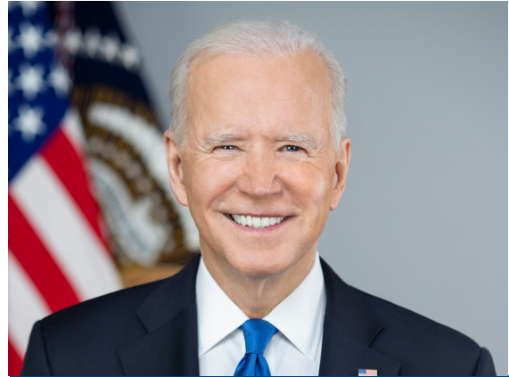
Biden's first year has been bittersweet.

Biden failed to win Senate approval for his $1.75 trillion Build Back Better economic plan. Not only was this a huge loss for his approval ratings, but also hurt millions of Americans.