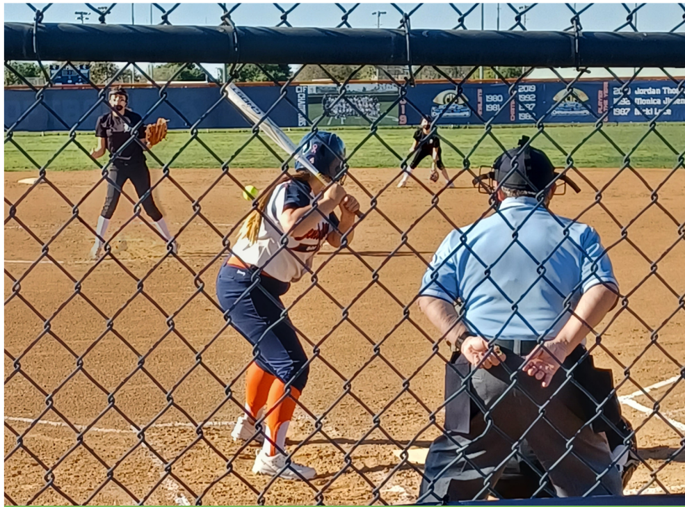
Softball is practicing for an up coming game