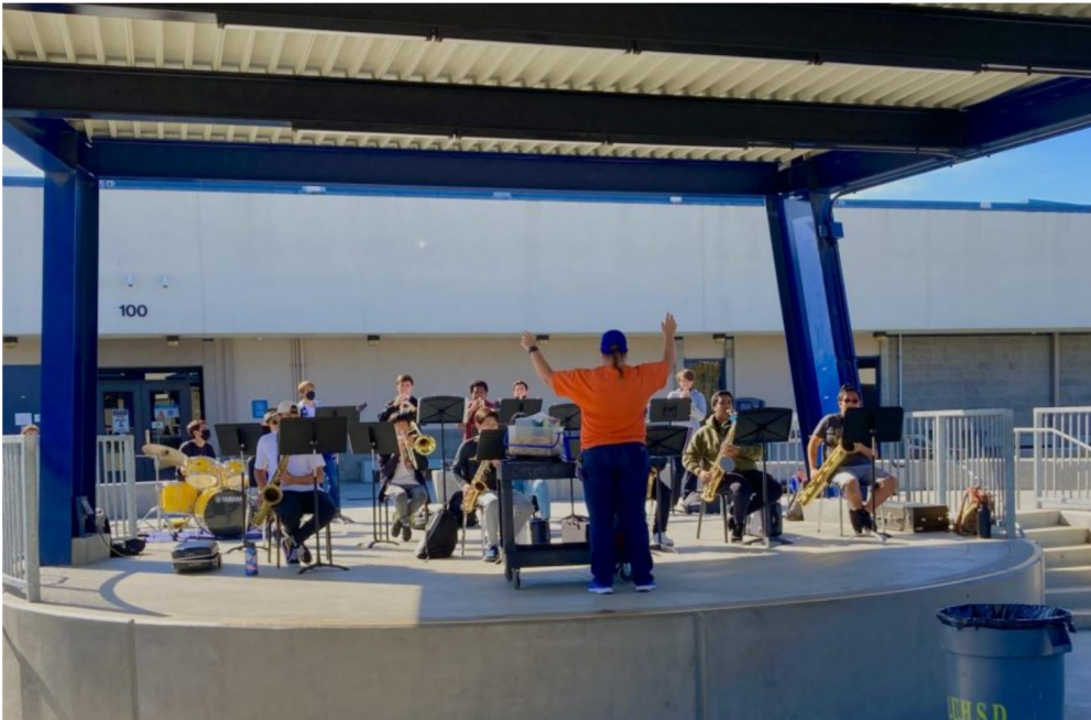
Every Monday, Wednesday, and Friday, Jazz Band practices their sound in the quad.

Cypress High School, home to a variety of extracurriculars, features Jazz Band, a group of students who meet up to make jazz music.