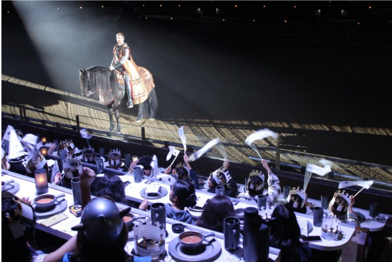
Students cheer on our school's knight during the thrilling show at Medieval Times.