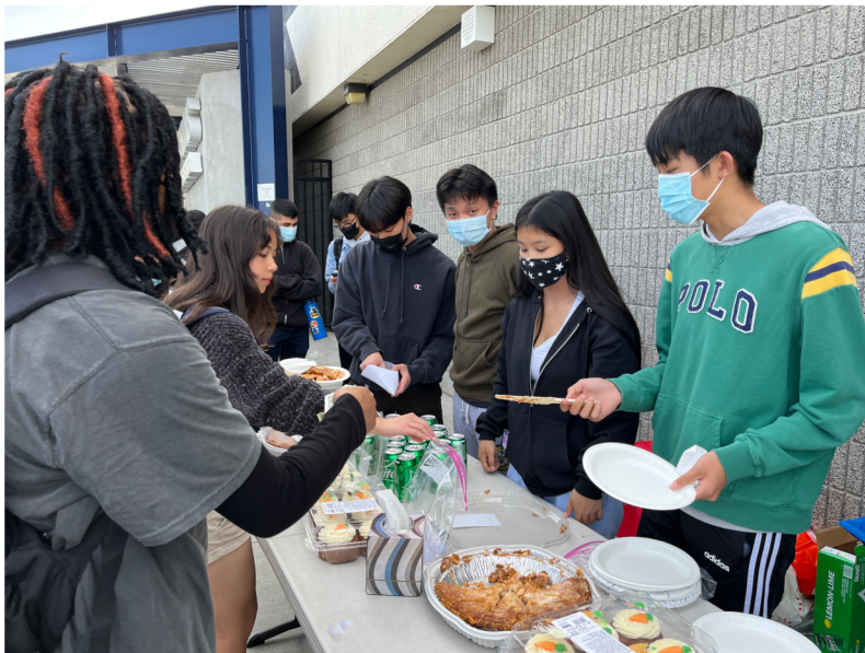
Math club works tirelessly to fundraise and support spreading the love for math!