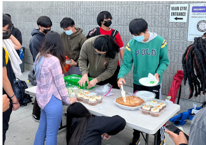
Students gather around Math club to support their fundraiser!