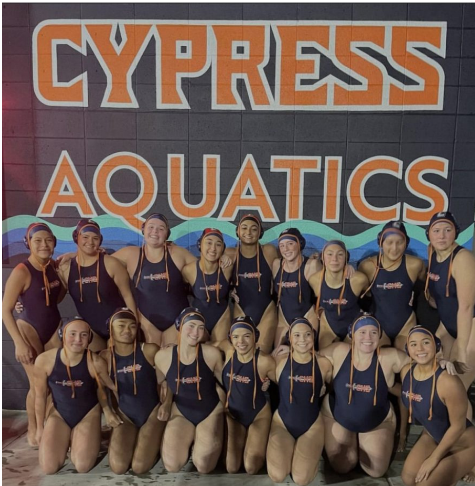
Cypress's Girls' Waterpolo team returns yet again to victory.