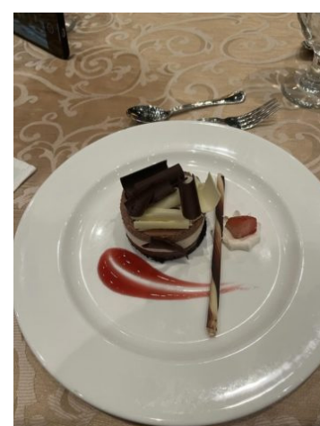
The meal portion of the night finished off with a dessert that many students loved.