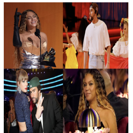
Beyoncé made history at the 65th annual Grammy Awards.

This year provided great entertainment for those who got the opportunity to watch it. The Grammy awards this year were very fair and will hopefully be the same the years to follow.