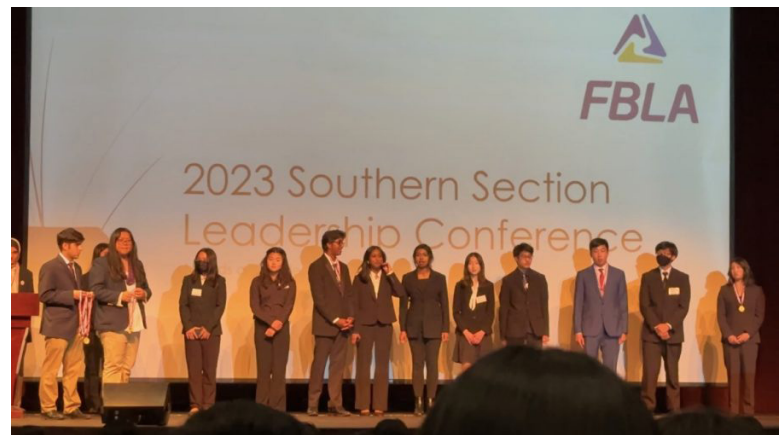
Cypress High School's FBLA is moving towards state!

club. He says, "anything having to do with business is something we can compete in. That's why I love FBLA because it is so diverse."