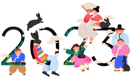
Happy New Year Centurions!

"Happy New Year!" Lunar New Year is a celebration of the arrival of spring and the beginning of a new year on the lunar solar calendar. Now, let's see what the people