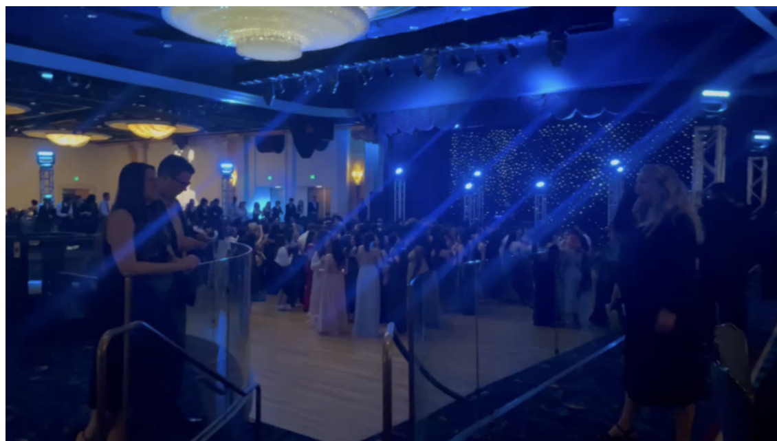
The aura of the colored lights at the Disneyland Hotel created a magical vibe at for students to dance to.

By Deborah Son, Student Activities Editor