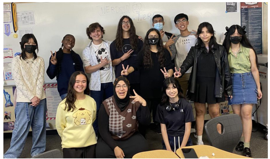
Decathletes did especially well this year in Math.

Whether you join to feel a part of something, make new friends, or simply because you want to learn something new, there's a little something for everyone in AcaDeca.