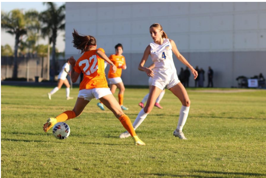
Cypress fights a hard battle in their game against Valencia.

In this spring season of sports, Cypress's Girls' Varsity soccer team is ready to bring victory