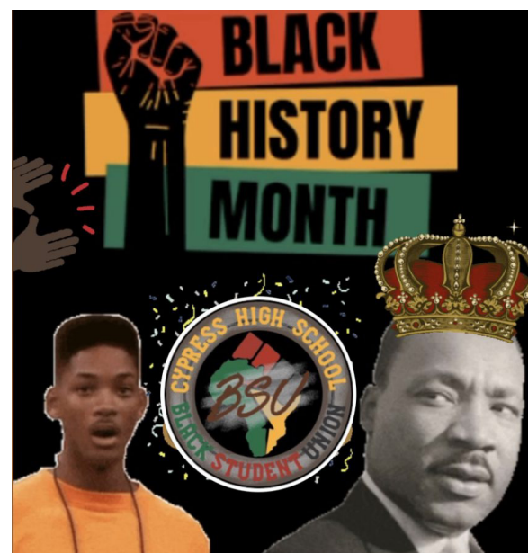
Black History month is a month that celebrates recognition, joy, and freedom as a whole. (Collage Credit: Juliana Dubois)

Black history month is not just a holiday for the African American Community, it is a worldwide Holiday that recognizes Black History and the purpose of having Rights, and celebrating a month of recognition, joy, and freedom as a whole.